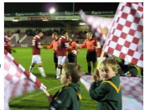
Cubs in Guard of Honor at Sixfields