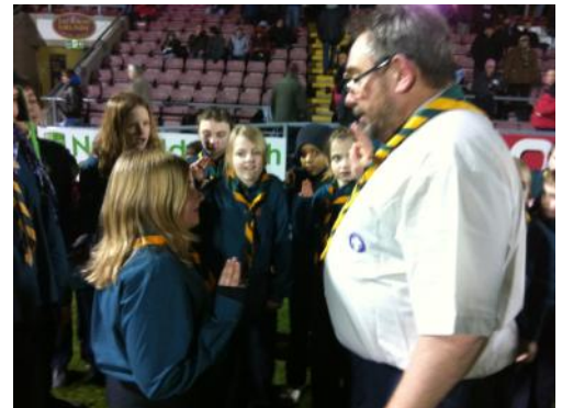
Scout gets invested on the pitch at half time

mini pioneering with marshmallows and dried spaghetti, it was a rewarding evening with many of the Scouts making all kinds of designs. We've had a couple of new Scouts join us recently and they seem to be enjoying it. The Leaders have been busy program planning and we have a hike, a night using short wave radio to try and talk to other Scouts around the world, we have "Solve it"