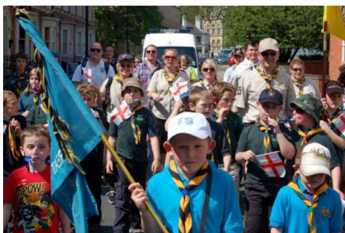
The 46th on parade at St Georges Day

Scouting is about Adults being offered a range of opportunities to develop new skills, try out and experience new activities, be part of a Team and meet new people.