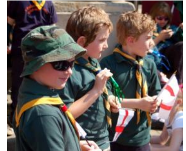
Getting ready for St George